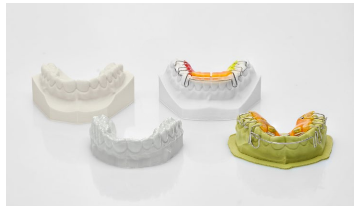
Designed for complete model fabrication for orthodontic applications