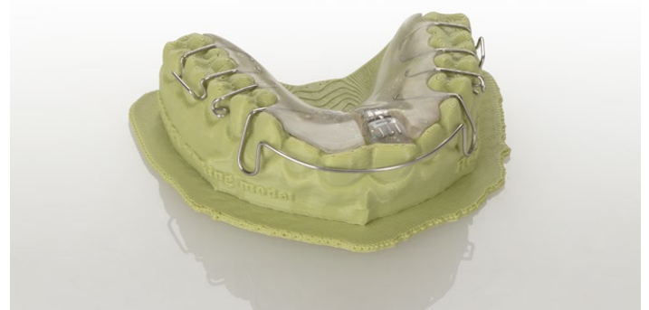
You can continue working with the model as usual without any post-processing